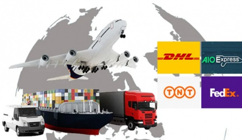
Packing & Delivery